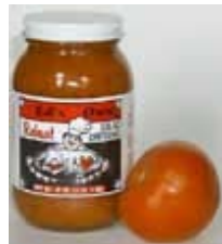
Eds Own Dressing $3.75